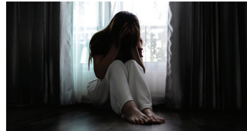
If you were the victim of adult sexual abuse, please call us at (866) 238-1452 so that we can help you seek justice.

24, 2022 and will close on November 23, 2023. During this one-year period, victims can bring civil lawsuits to hold abusers accountable, regardless of when the abuse occurred. The ASA recognizes that it takes a long time for many survivors to psychosocially process their trauma and provides adult survivors with an opportunity to seek justice.